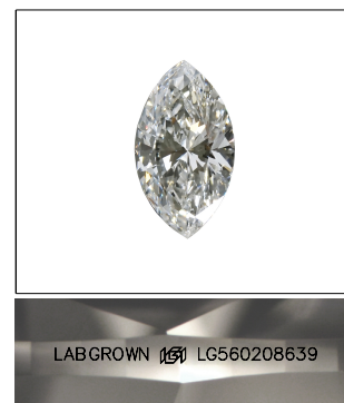
LASERSCRIBE SM Sample Image Used

Comments: This Laboratory Grown Diamond was created by Chemical Vapor Deposition (CVD) growth process and may include post-growth treatment. Type IIa