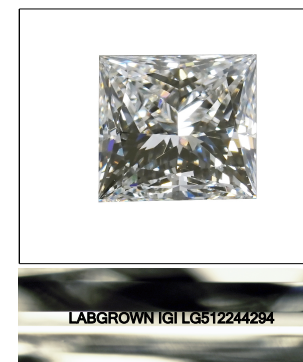
LASERSCRIBE SM Sample Image Used