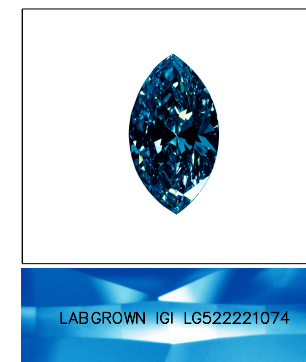
LASERSCRIBE SM Sample Image Used

July 12, 2022 IGI Report Number LG522221074 Description LABORATORY GROWN DIAMOND Shape and Cutting Style MARQUISE BRILLIANT Measurements 12.37 X 6.90 X 4.33 MM GRADING RESULTS Carat Weight 2.16 CARATS Color Grade FANCY DEEP BLUE Clarity Grade VS 1