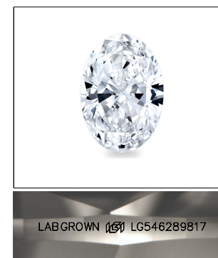
LASERSCRIBE SM Sample Image Used