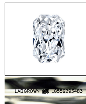
LASERSCRIBE SM Sample Image Used