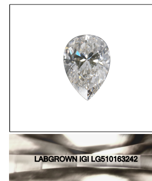
LASERSCRIBE SM Sample Image Used