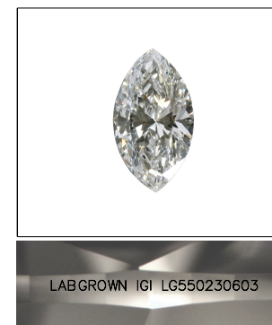
LASERSCRIBE SM Sample Image Used

Polish EXCELLENT Symmetry EXCELLENT Fluorescence NONE Inscription(s) LABGROWN IGI LG550230603 Comments: This Laboratory Grown Diamond was created by Chemical Vapor Deposition (CVD) growth process and may include post-growth treatment. Type IIa